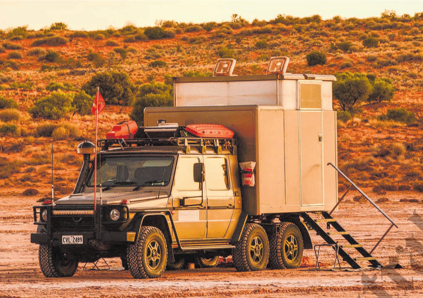
Shower and toilet facilities in an Outback Spirit support vehicle in the Simpson Desert.