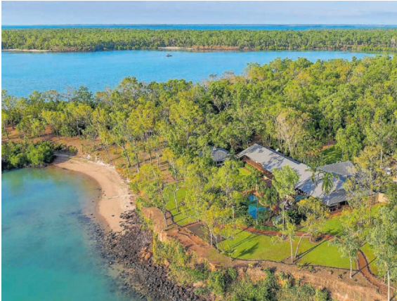
Seven Spirit Bay in the Northern Territory.